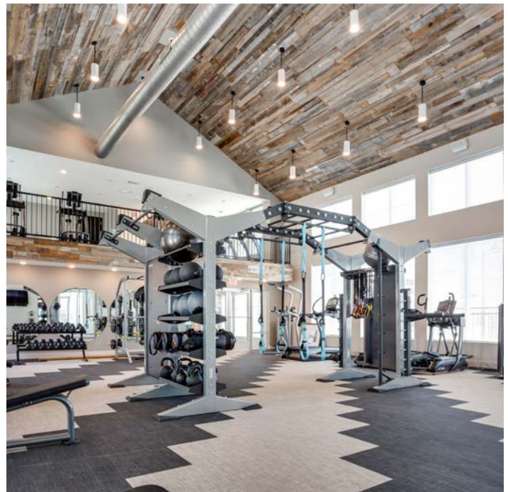
*Examples Of Luxury Amenities

study from the National Multifamily Housing Council asserted that even with increasing borrowing costs, cap rates may remain unchanged due to the ability to grow rents. 9